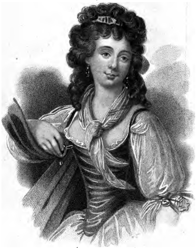
Ingrana to Hours Mayor